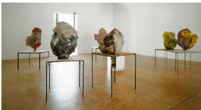
Franz West, Group with Cabinet , ensemble of 8 sculptures, 2001 © Franz West © Centre Pompidou / Dist. RMN-GP / Ph. Migeat

Franz West was one of a generation profoundly marked by the Viennese Actionism and Performance Art of the 1960s and 1970s. Interested in philosophy and psychoanalysis, he sought to relocate art in everyday life and to call into question the status of the work of art. He was renowned in particular for the interactive aspect of his works, concerned with the body and its occupation of space. Between 1977 and 1982 West made a name for himself with his Passstücke ( Adaptives ), plaster pieces made to be handled by the public. In the 1980s he made sculptures of papier mâché, sometimes in collaboration with other artists, among them Heimo Zobernig and Albert Oehlen. Throughout his career, he worked with musicians, theatre directors, writers, choreographers and photographers. In exploring the relationship between art and the public he produced sculptures that were also seats, like his famous Chaise longue . His last years were notable for large coloured sculptures installed in the public realm, some in Central Park, New York, others in the Place Vendôme à Paris or on the Stubenbrücke bridge in Vienna.