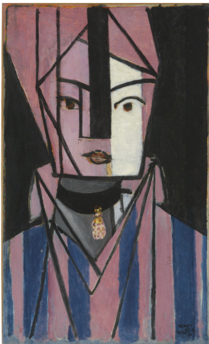
Henri Matisse, Tête blanche et rose , 1914

This exhibition is produced in partnership with Kunstmuseum Basel.