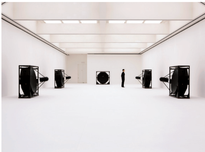
Ryoji Ikeda, Matrix [5ch version] , 2009 © Ryoji Ikeda