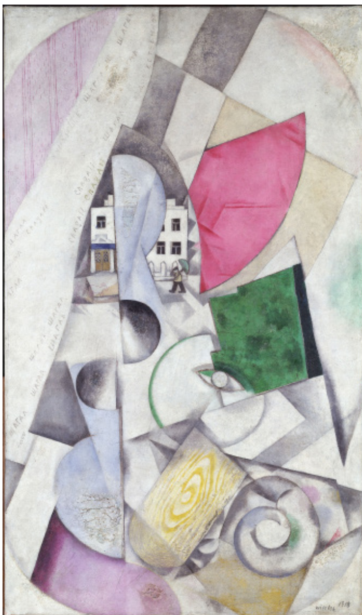
Marc Chagall, Paysage cubiste , 1919-1920

The Centre Pompidou is to devote an exhibition to the Russian and Soviet avant-garde as represented by the so-called School of Vitebsk. Concentrating on the emergence of the movement in the years between 1918 and 1922, around the commanding figures of Marc Chagall, El Lissitzky and Kazimir Malevich, the exhibition explores the extraordinary explosion of revolutionary artistic activity in the city.