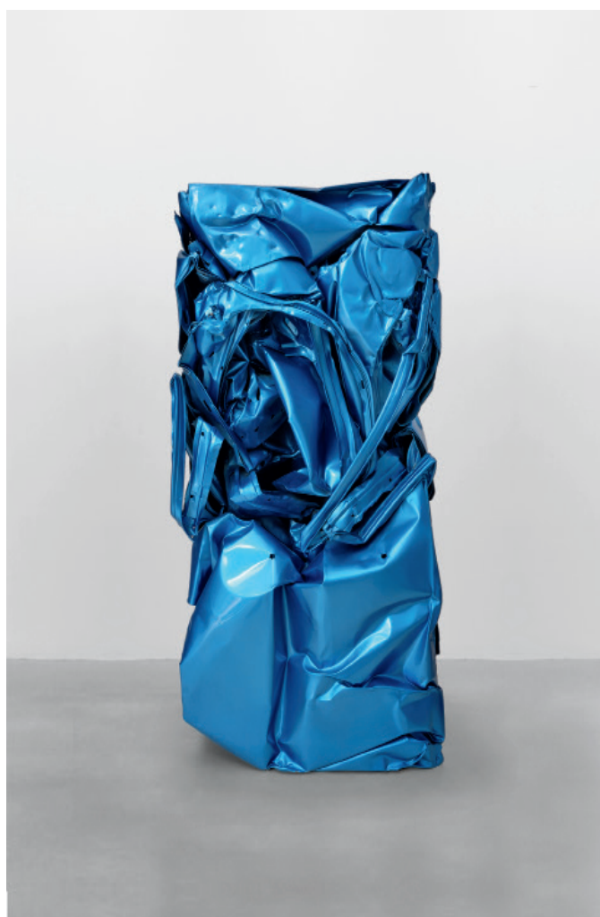
César Blu Francia 490, 1998,

This retrospective marks the 20 th anniversary of the artist's death. Famous by the age of 25, César enjoyed an artistic career of more than 50 years. He is, however, the last major figure among the Nouveaux Réalistes (New Realism) not to have been accorded a retrospective at the Centre Pompidou. Through more than a hundred pieces displayed in the largest of the Centre Pompidou's exhibition spaces – among them the most famous of his major works, as well as representatives of lesser-known series – this exhibition will offer an unprecedented overview of the career of one of the greatest sculptors of his time, in all its diversity and coherence.