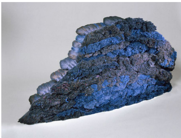
Sheila Hicks, Banisteriopsis - Dark Ink , 1968-94 © Philadelphia Museum of Art, Philadelphia © DR

The Centre Pompidou is to devote an exhibition to Sheila Hicks, a pioneer of textile art. Her works in wool, linen and cotton raise important aesthetic questions too often forgotten.