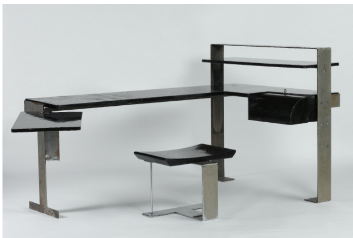
Pierre Chareau, Desk for Robert Mallet-Stevens , 1927

The Union des Artistes Modernes (French Union of Modern Artists) was one of the most broad-ranging of 20th-century artists' associations. The Centre Pompidou is to devote an unprecedented retrospective to this major current of European Modernism, which helped make Paris one of the world capitals of the avant-garde. The U.A.M. brought together not only architects, painters and sculptors, but also furniture makers, photographers, fabric designers, jewellers, bookbinders, poster artists and graphic designers.