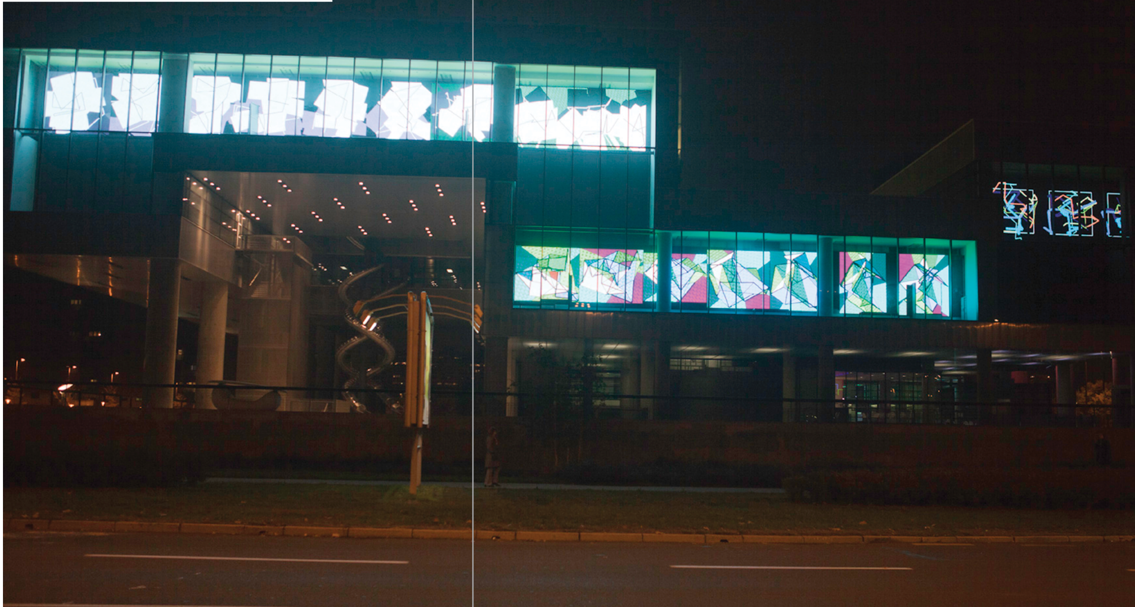
From Space.color.motion , 2002, Manfred Mohr. Media Facade of the Museum of Contemporary Art, Zagreb.